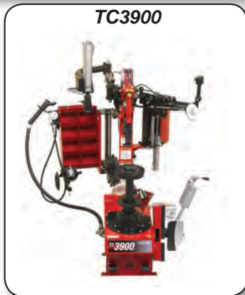
Shown with optional Side Shovel