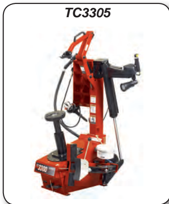
Shown with optional Plus Roller